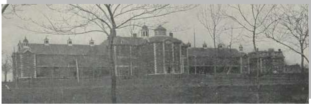
VG HOSPITAL -1917