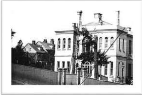
COGSWELL STREET MILITARY HOSPITAL

Other places were utilized such as: the YMCA as a military hospital, the Halifax Ladies College and the Academy of Music. Doctors and nurses from Cogswell Street